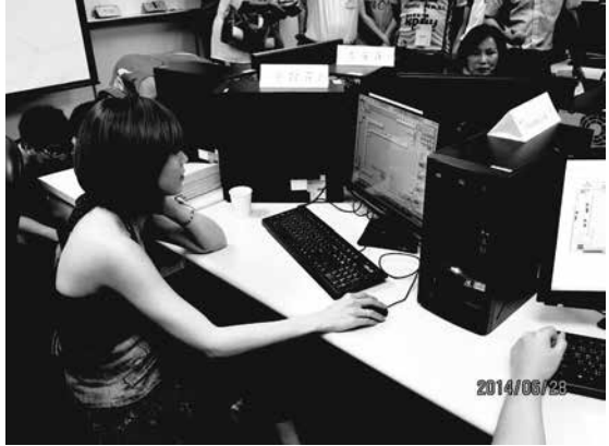
Go 9×9 Man-Machine Tournament