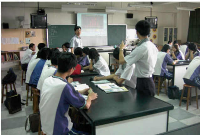
Figure 1. The TCCAI setting.

The teacher-centered CAI (TCCAI) scheme in the current study is a mixture of whole-class presentation, interactive discussions among the teacher and students, and classroom activities using the CAI software. The instruction emphasized direct guidance and presentation, occasional demonstrations, and clear explanations of important concepts to the students given by teachers in the earth science classroom/lab. The whole-class presentation was implemented using a combination of a high-speed laptop computer and a high-resolution liquid crystal display (LCD) projector to display the CAI contents on a large screen in front of a whole class (Figure 1). Besides, class discussions between the teacher and the students and among students were also embedded in this teaching format. It is noted that the whole-class presentation was intended to be interactive in nature in order to ensure maximum interactive