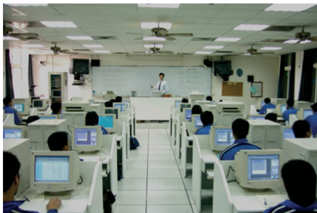
Figure 2. The SCCAI setting.

To assess students' preferences of learning environments, a Chinese version of the Constructivist Learning Environment Survey (CLES) originally developed by Taylor and Fraser