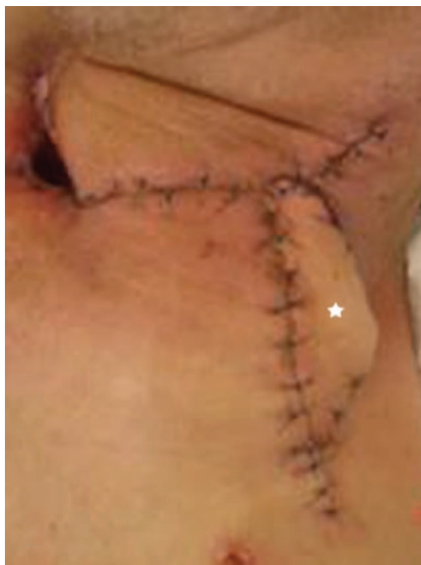
Figure 2. After salvaged surgery, the PMMF successfully terminated the intractable CL and the flap healed well without identified fistula. CL=chylous leakage, PMMF=pectoralis major myocutaneous flap.