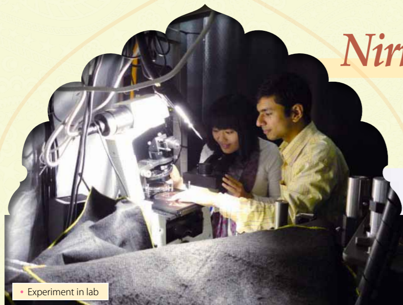
• Experiment in lab