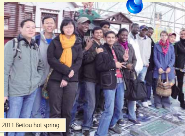
• 2011 Beitou hot spring

Besides lab experiments, we have many activities inside or outside our university