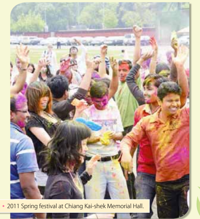
• 2011 Spring festival at Chiang Kai-shek Memorial Hall.

to introduce me as I ask people "Do you know, Assamu nai cha?," then I replied as my home is in Assam. Before came to Taiwan, I don't know that Assam tea and Indian curry is popular here. When we cook for my friends and eat together I feel very happy. I visited some of the places in Taiwan. Some of the great views of Taiwan took place in my mind, which I share with..... All these activities became a part of my memorable moments being in Taiwan, which will be a chapter of my memory book. ■■■