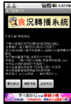
Fig. 4. Delicacy Summary