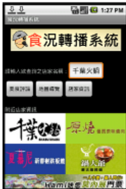
Fig. 3. Query Message

comments from web contents via WCRA and provides the delicacy comment summaries via MDS based on cloud computing to help mobile users make their delicacy decision shown as Figure 4.