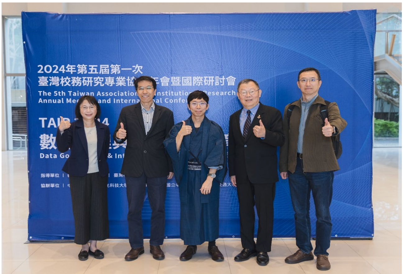
Group photo of distinguished guests attending the conference.