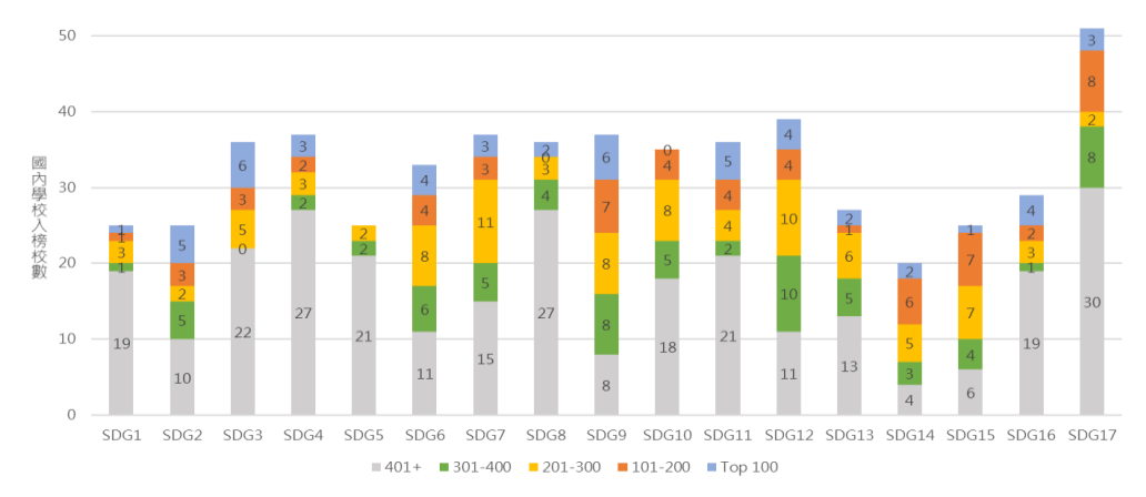
Figure 2: Distribution range of SDG rankings of domestic schools

In 2024, NYCU ranked 50th globally and second nationally, an improvement of 33 places from last year. The university participated in the Impact Rankings with 11 SDGs, with five SDGs placing in the top 100. The top three highest-scoring SDGs were SDG 9 (Industry, Innovation, and Infrastructure), ranked 38th globally, SDG 3 (Good Health and Well-being), ranked 27th globally, and SDG 16 (Peace, Justice, and Strong Institutions), ranked 29th globally. The distribution of SDG rankings among domestic universities is detailed in the figure 2. In response to climate change and the transition to a sustainable economy, NYCU continues to promote sustainable education by developing strategies for cultivating sustainable talent, integrating sustainability concepts into courses and research, enhancing the awareness of sustainability goals among faculty and students, and incorporating sustainable development goals into the university's vision. This commitment aims to create a friendly campus environment and demonstrate the university's sustainable development capabilities.