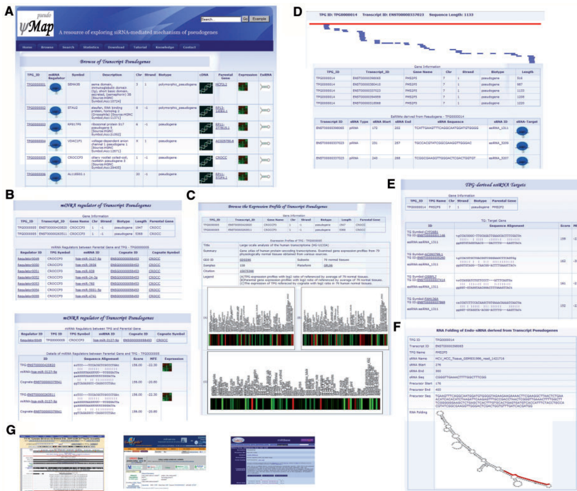
Figure 3. Web interface of pseudoMap. (A) Browse interface of pseudoMap illustrates general information of TPGs, miRNA regulators, esiRNAs and gene expression profiles. (B) The miRNA regulator indicates the miRNA decoys mechanisms between TPG and its cognate. (C) Gene expression profiles of TPG and its cognate gene in various experimental conditions. (D) The diagram of esiRNA represents TPG-derived siRNAs as profiled by deep sequencing data. It displays the more fine-grained information of (E) esiRNA-target interaction and (F) RNA folding structure of TPG-derived esiRNA. In addition, pseudoMap also incorporates the external sources, such as (G) UCSC genome browser for a genomic view, GeneCards for gene annotation and miRBase for miRNA annotation.

As a web-based system, pseudoMap can thoroughly identify TPGs, including TPGs act as a miRNA regulators and TPGs-derived eSTIs in humans. There are two ways to access pseudoMap: by browsing the database content or by searching for a particular TPG. Figure 3A displays the