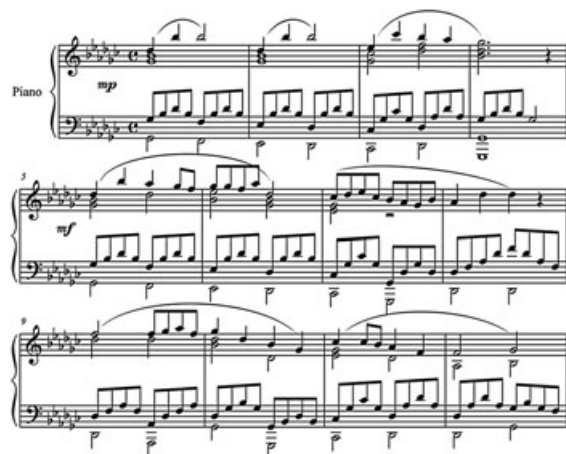
Figure 1. Excerpt from researchers’ composition of sedating music

Interventions consisted of listening to sedating or stimulating music or quiet rest. An auto-reverse multi-laser disc player (UX-P450, JVC, Japan) and wireless stereo headphones (Camma HR-805, Taiwan) were used for listening to the music. Four sedating musical pieces included in the study were (1) Beethoven: Piano sonata No. 14 Moonlight, (2) Beethoven: Romance for Violin No. 2 in F major and (3) Mozart: Andante from Piano Concerto No. 21 in C Major (CM music Records Co. 1992, Taipei). The fourth piece was composed and recorded by the authors (P-W. and H-L.) of this study (Figure 1). The musical tempos ranged from 60 to 80 beats/min (slow) and had minor tonalities, smooth melodies and no dramatic change in volume or rhythm