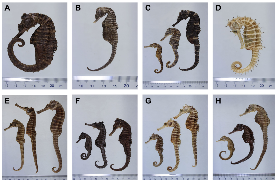
Fig. 2 – Pictures of dried seahorses of different Hippocampus species: (A) H. algiricus (TS20MO-1); (B) H. capensis (TS16MO-1); (C) H. comes (left to right: TS12MO-2, TS10MO-2, and TS09MO-1); (D) H. histrix (TS09MO-2); (E) H. kelloggi (left to right: TS18MO-1, TS05MO-1, and TS09MO-4); (F) H. kuda (left to right: TS19MO-1, TS10MO-4, and TS12MO-1); (G) H. spinosissimus (left to right: TS02MO-1, TS21MO-1, and TS17MO-3); and (H) H. trimaculatus (left to right: TS06MO-2, TS13MO-1, and TS04MO-1).

The cyt b sequence acted as a good genetic marker to reveal relationships among seahorse species and was also used in many studies on seahorse population genetics [30–32].