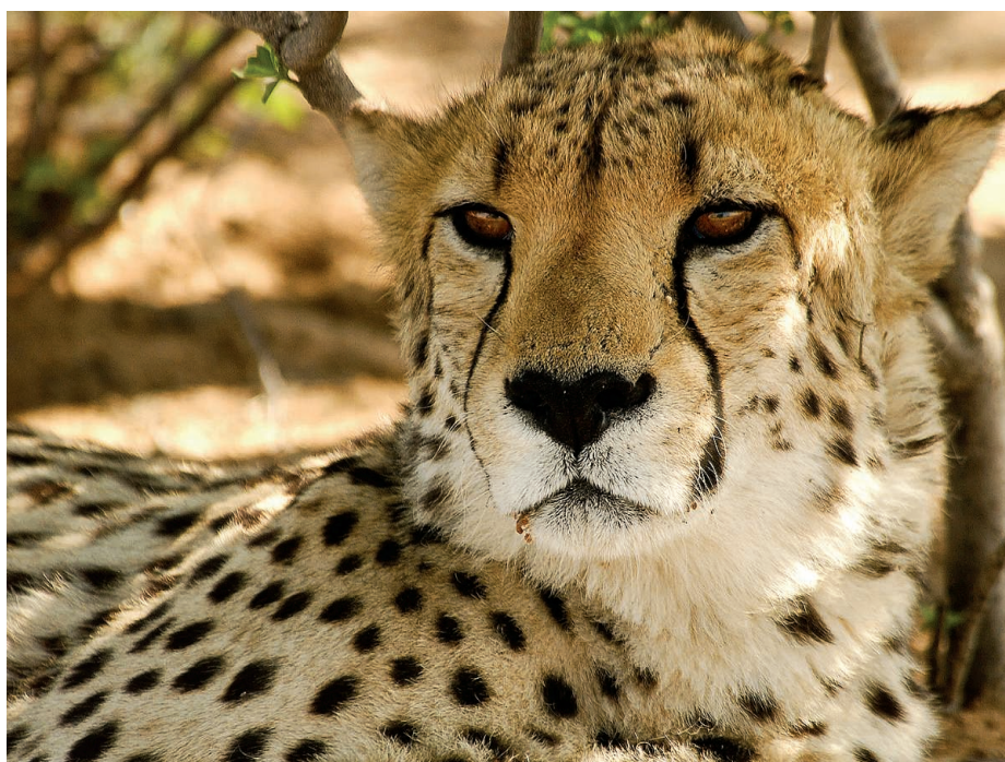
The hunt is on. Cheetahs reach famously high speeds during hunting, but Scantlebury et al. show that it is the search for prey rather than the chase itself that is energetically more costly.