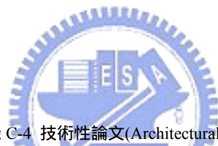
附錄 C-4 技術性論文(Architectural Institute of Japan)