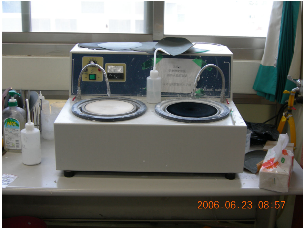
Fig. 3.12 Photograph image of grinding and polishing machine