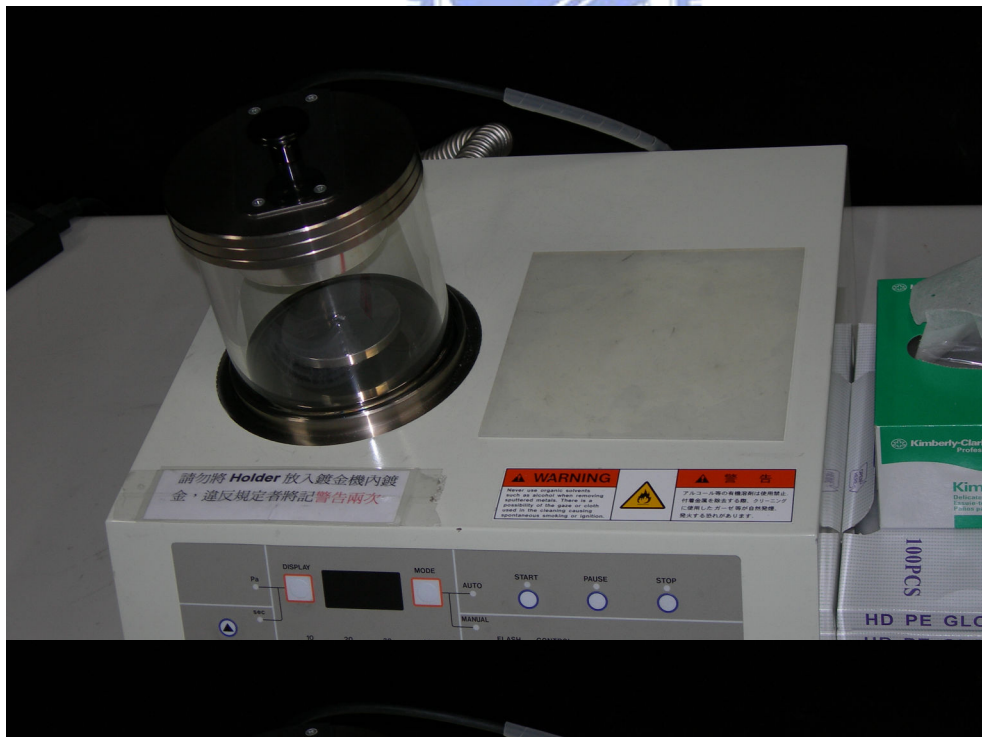
Fig. 3.11 Photograph image of Pt coating