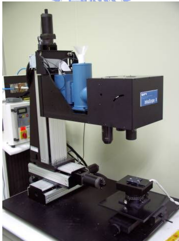
Fig. 3.15 Photograph image of infrared rays