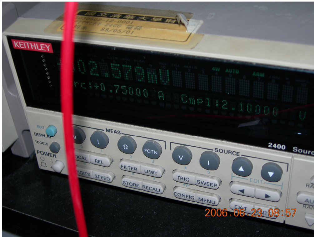
Fig. 3.14 Photograph image of current source keithley 2400