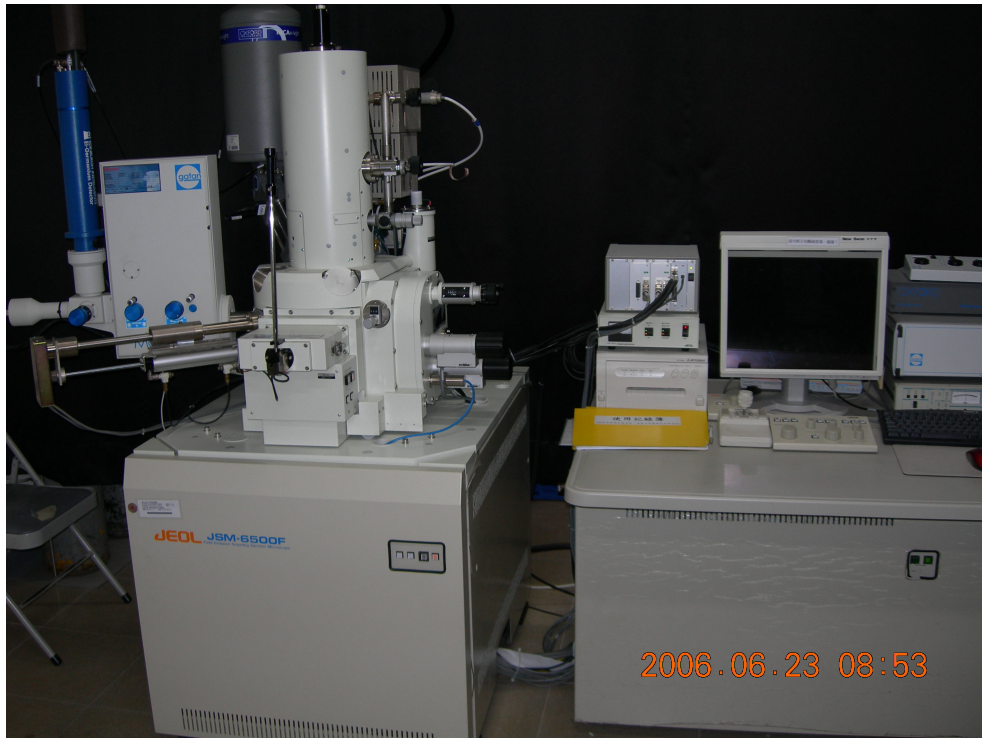
Fig. 3.10 Photograph image of SEM